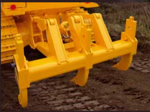
The optional three-shank, parallelogram type ripper is ideal for ripping in tough material.