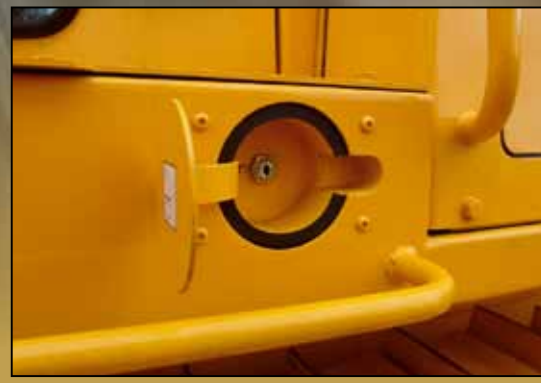
Electrical system master switch located on LH side is accesible from ground level.