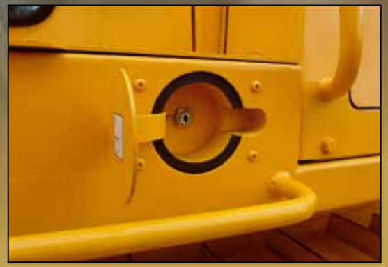
Electrical system master switch located on LH side is accesible from ground level.